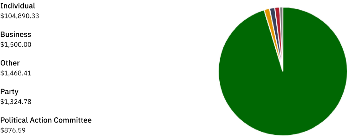
Contributions made to committee for 2024

See how the committee has spent money, and what kind of goods and services it received as in-kind contributions.