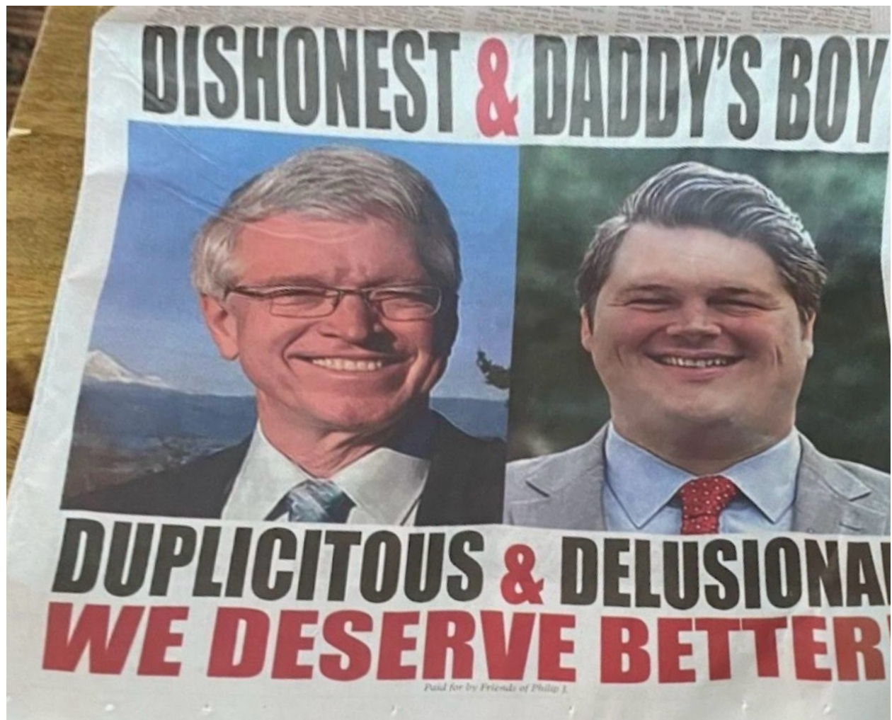
Placed in The Reflector 's September 25 edition