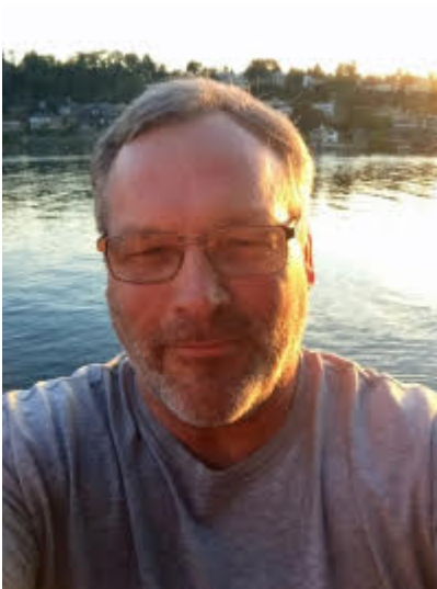
Exhibit #4 Page 3 of 6

I've lived in Milton for 28 years, and I know that still makes me a "newcomer" : ) -- most of my neighbors have grown up in Milton -- but it is with their encouragement that I am running for city council. Milton struggles with the same issues again and again: effective leadership, future development, and appropriate infill development in existing neighborhoods. We all enjoy the small-town feel and look of Milton, and I believe Milton needs to focus on a cohesive strategic plan as our best chance at keeping it. We need to be proactive rather than reactive, and everyone should be involved in the process. I would like to see community listening sessions with the public before big issues are discussed at council meetings, so public input is first, not last. I pledge to listen to your concerns -- it would be my honor to serve you.